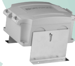
WD-100 - Water Detector Standalone