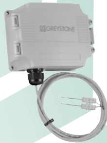
WD-102 - Water Detector c/w Remote Sensor