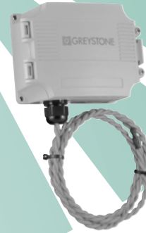
WD-100-XX - Water Detector c/w Conductivity Cable